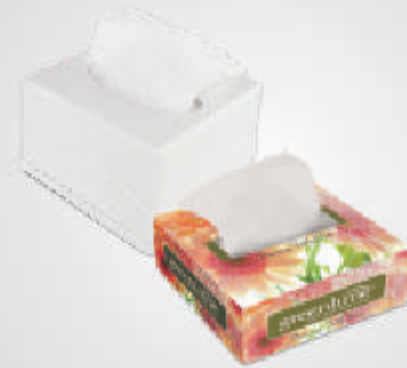
Pop-up Napkin ABS Plastic Dispenser and Box Pack.

Greenlime's napkins and serviettes are totally safe on food and skin, and specially designed to serve your hygiene needs in different ways. Napkins, which are made of 1-ply single-tissue sheets, are ideal for small wipes. The relatively thicker, 2-ply serviettes, on the other hand, are a more presentable and hardworking option for lavish parties.