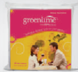
Greenlime Dinner Serviettes