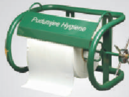
Kitchen Roll Stand Code: 07410001