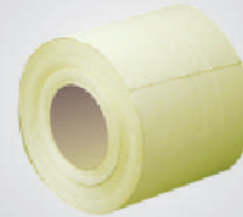
Centre Pull Roll