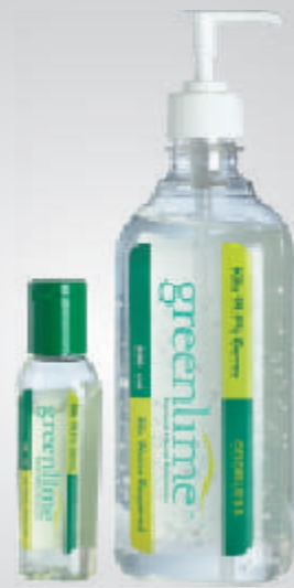
50 ml 500 ml