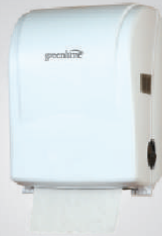
Auto-cut Hand Towel Dispenser Code: 0741039