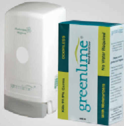
Greenlime Pump and Pouch Dispenser and Refill