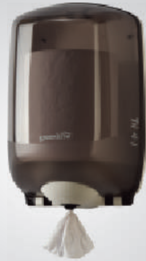
Centre Pull Hand Towel Dispenser Code: 07410038