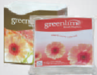
Greenlime Snack Napkins